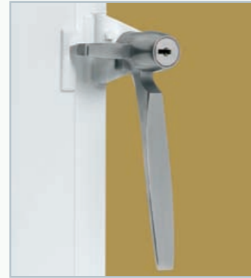
Satin chrome locking handle

Incorporates a strong 4-lever lock mounted in the side of the handle grip to deter burglars