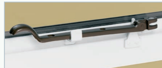
Kiddicare safety catch

Factory-fitted to order on side hung ventilators it limits the window opening to about 100mm and can be passed only by a positive but simple key operation, normally out of the reach of children. Available in white and brown