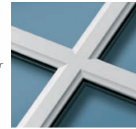
Heritage Glazing Bar

Standard for double glazed unit ( DG version ) in small pane, Georgian style and classic style horizontal pane. Standard for double glazed unit ( L version ).