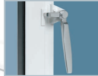
Satin chrome handle