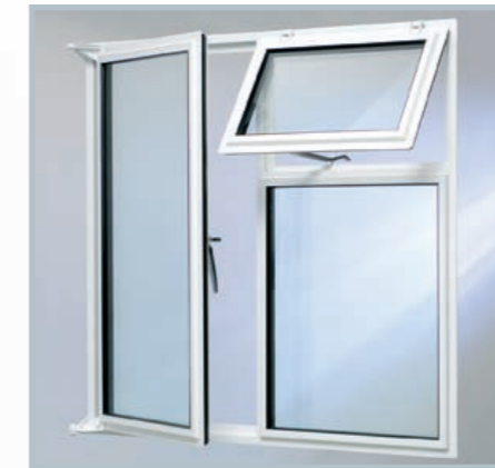
Homelight L Window