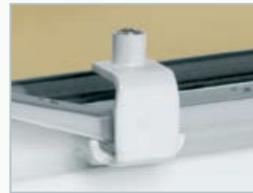
Brass RTD peg stay