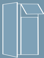
Modern large pane picture window

A wide range includes all the popular combinations of side hung, top hung and fixed light windows with three basic styles available (see below).