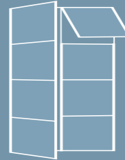
Classic style horizontal pane