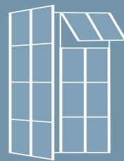
Small pane 'Georgian' style